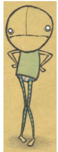
All artwork courtesy of Tommy Kovac

Location: Chapman University's Leatherby Libraries, One University Drive, Orange, CA, 92866. Chapman University is located on Glassell between Palm and Walnut in the city of Orange near Old Towne Orange and the Orange Circle. An area map is available at www.chapman.edu/map