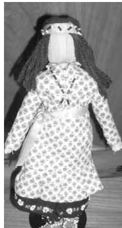
Mid. 20th Century Corn Husk Doll

Although still a matter of scholarly dispute, the model of the Iroquois Confederacy might well have influenced the writers of the American Articles of Confederation and the Constitution of the United States . Certainly, Benjamin Franklin, who early in his career was a diplomatic representative to the Iroquois Nation from the colony of Pennsylvania, admired the system developed by the Indians, and encouraged the colonists to look to the Iroquois Confederacy as a model of government.